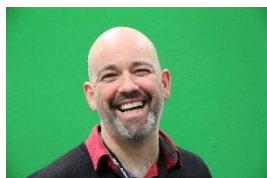
Acting Principal Teacher