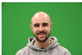
Acting Principal Teacher